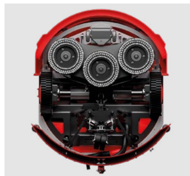
Optimal brush layout