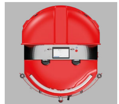
User-friendly control interface