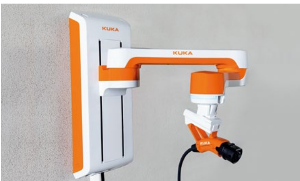
The fully automated power charging docking station based on the KUKA charging assistant with carla_connect technology